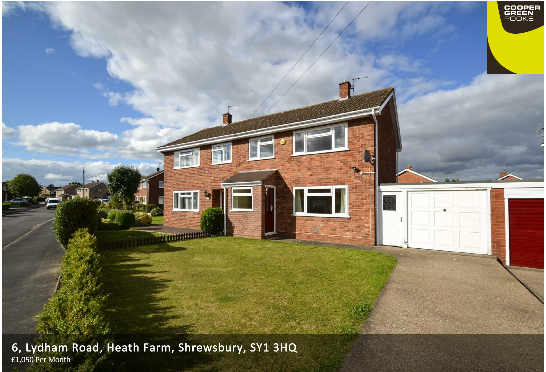
6, Lydham Road, Heath Farm, Shrewsbury, SY1 3HQ £1,050 Per Month